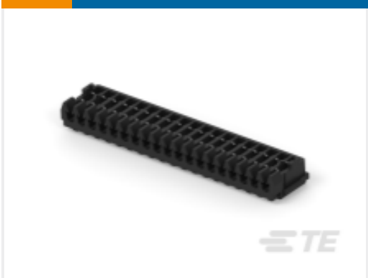
TE Part # 3-353293-9 1.5MM CT MT REC ASSY 19P BLACK