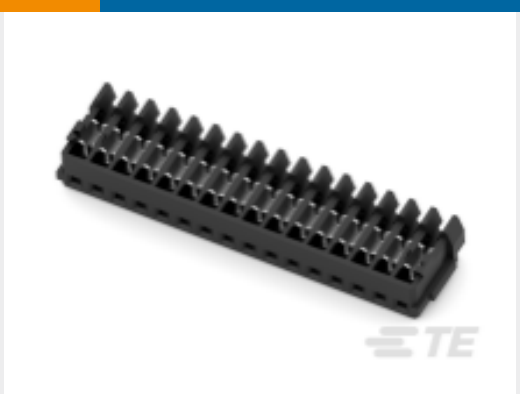
TE Part # 3-353293-6 1.5MM CT MT REC ASSY 16P BLACK