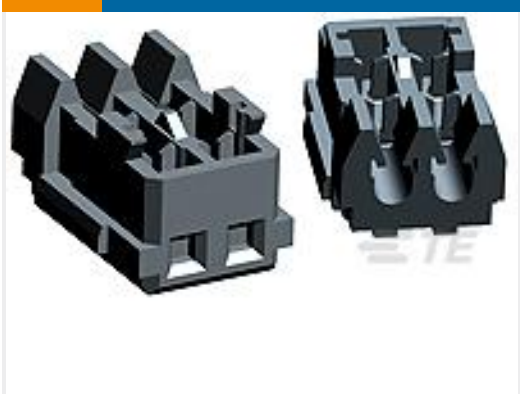
TE Part # 1-353293-9 MINI CT MT REC ASSY 19P GRAY