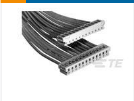
TE Part # 4-179228-3 CT CRIMP-2 REC HSG 3P YELLOW