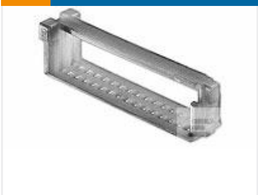
TE Part # 3-353294-4 AMP MINI D/R HDR HSG 34P NATU