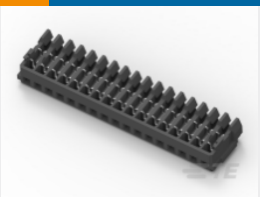
TE Part # 3-353293-7 1.5MM CT MT REC ASSY 17P BLACK