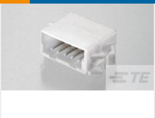
TE Part # 292254-3 CT RELAY HDR ASSY 3P NAT